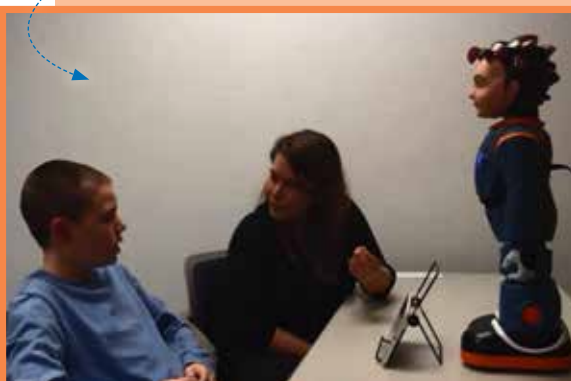
• ENGAGEMENT WITH THERAPIST